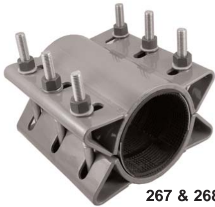
267 & 268-100